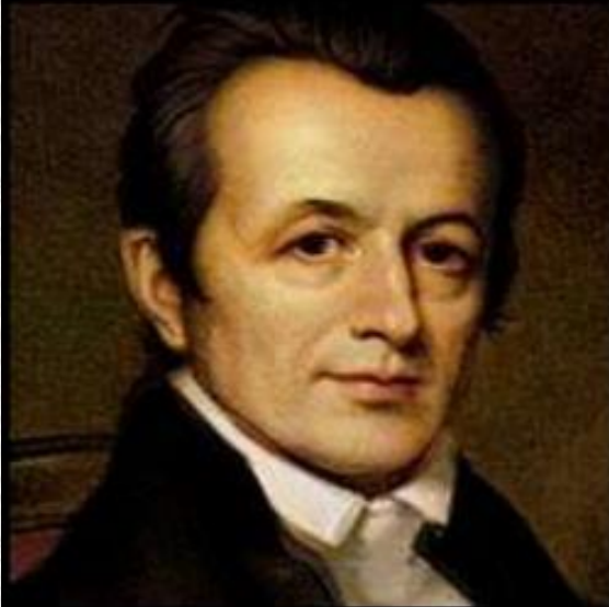
Adoniram Judson's Last Words

"I am not tired of my work, neither am I tired of the world; yet when Christ calls me home, I shall go with the gladness of a boy bounding away from school."