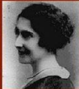
Jeanne Louise Calment 21 February 1875 – 4 August 1997 122 years, 164 days