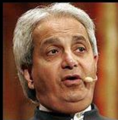
Benny Hinn – Net Worth $42 Million