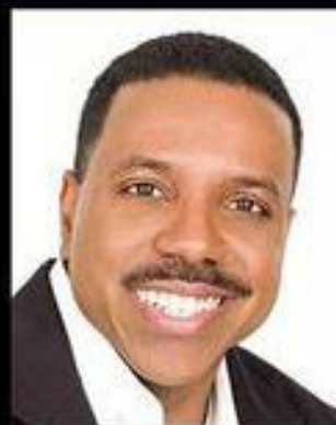
Creflo Dollar – Net Worth $27 Million