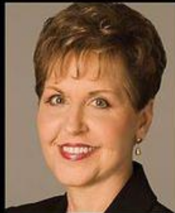
Joyce Meyer – Net Worth $25 Million