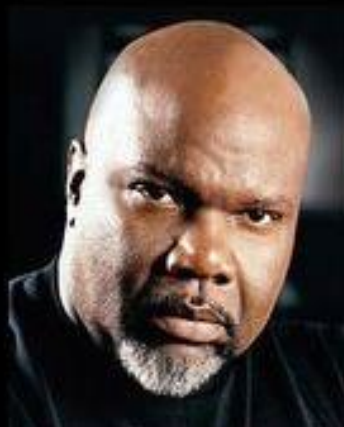
T.D. Jakes – Net Worth $150 Million