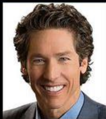
Joel Osteen – Net Worth $40 Million

“Go and sell everything you own and give it to the poor, so you will have treasure in heaven. Then come and follow me.” Mt 19:21